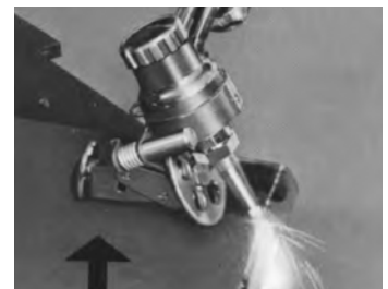
Beveling Wheel (Included in Handy Auto Professional kit)