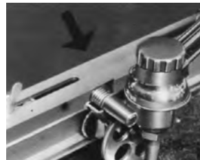
Guide Rail Part#ZS30104