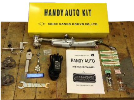
Handy Auto Professional Kit (includes accessories and steel carrying case/box)