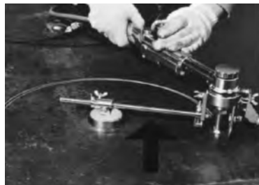
Extra large circle cutting attachment 5 - 40 in (120-1,000mm) Part#ZS30130