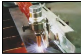
Guide rail for straight line cutting Part#ZS30104