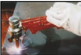
Attachment for small circle cutting ø 1¼-8 in (ø30- 200mm) Part#61001597