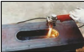
Arcs, curved lines