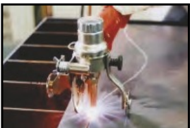
Guide handle (included in Professional & Plus Professional) Part#ZS30105