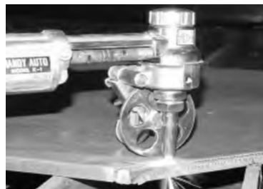
Straight Cutting (Included in all kits)