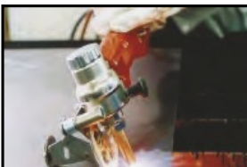
Wheel set for bevel cutting 22° - 45° (included with Handy Auto Plus) Part#ZS30102