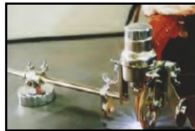
Large circle compass ø5-19 ¾ in (ø125- 500mm) Part#ZS30106