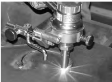
Small circle cutting attachment 1¼ to 4½ in (30-120mm) (Included in all kits)