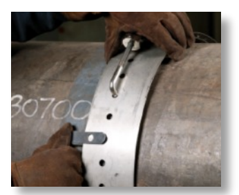
Adjusting for Guide Rail Overlap