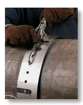
Clamping Guide Rail Overlap

The guide rail provides high cutting accuracy and makes the Auto Picle P -S Type plasma pipe cutting machine particularly suitable for large pipes. Countless professionals including fabricators, scrap yards, boiler makers and tank manufacturers are using Koike pipe cutting machine products successfully.