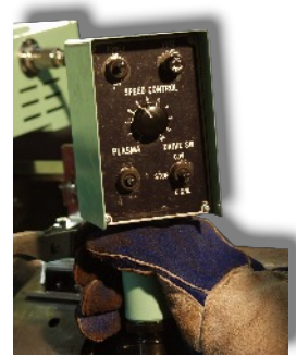
Remote Control Pendant allows safe control away from cutting workpiece