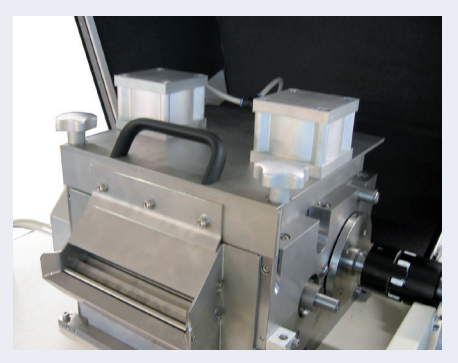
All sizes have two pneumatic cylinders on the upper feed roller for optimum feed action