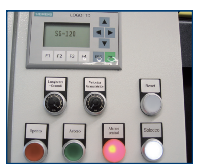
Online pellet length adjustment