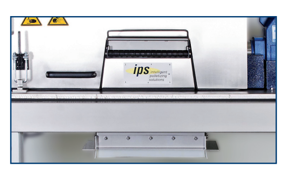
Pellet outlet can be adjusted to suit the customer's requirements