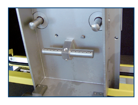
Cutting area cooling