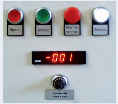
Robust, clear operating and display elements