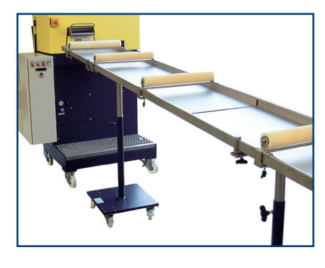
Strand feed from strand cooling trough to strand pelletizer

Other ips system components are available (strand die head, strand cooling trough, strand dewatering system, strand feed guide, classifier)