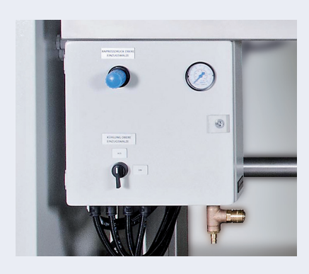
Easy access to the pneumatic control system