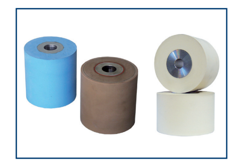
Various coatings for the upper feed roller