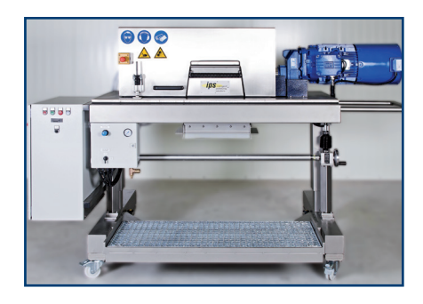
Sub-frame can be adjusted to suit the customer's requirements

Cutting tools can be optimally adjusted to your requirements; cutting rotors of hardened chromium steel, of sintered PM steel or with clamped or soldered HM blades