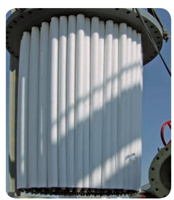
Removal of filter pack in a desalination plant in Algeria. Production \ capacity: 200,000 \ \ m^3/d.