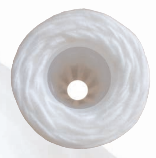
Detail of a Fluytec Polypropylene Cartridge Core.

On the other hand, in Fluytec depth filtration the filtering medium is thicker and its pores are smaller, equal to or greater than that of the particles to be retained. In this case, as well as direct interception, phenomena of initial impact and/or diffuse interception occur that allow particles smaller than the pores in the filtering medium to be retained.