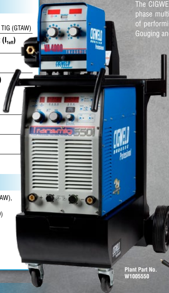
Plant Part No. W1005550

The CIGWELD Professional Transmig 550i is a three phase multi process welding inverter that is capable of performing GMAW/FCAW (MIG), MMAW (Stick) / Gouging and GTAW (Lift TIG) welding processes.