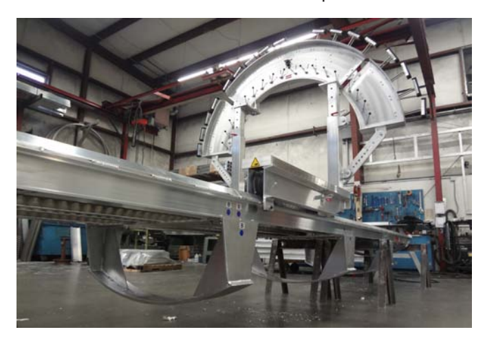
Curved Aluminum Wrappers to support machine on the bottom of torpedo kiln

Arch Trolley cart to support arch and move the length of the deck