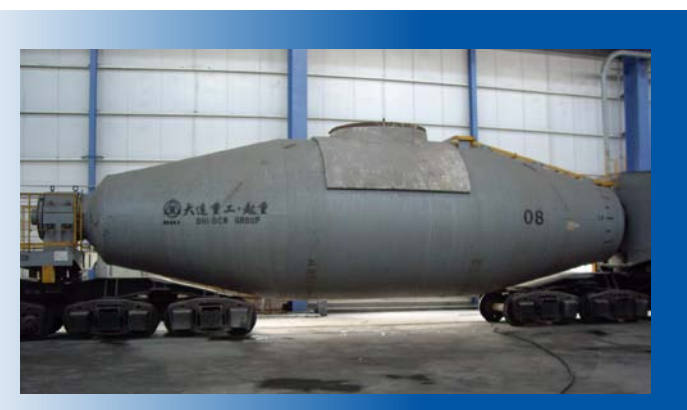
Custom built for any size torpedo ladle

Cylinder bumpers articulate to allow full contact with the refractory. 3 Way Master Valve allows for independent operation or all cylinders simultaneously.