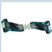
BL-875: BLUETOOTH 2xRS232 PAIRED DEVICES