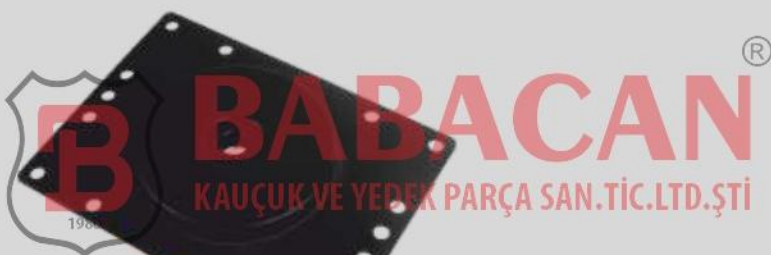
Upper Shock Absorber Üst Takoz Верхний эластомер