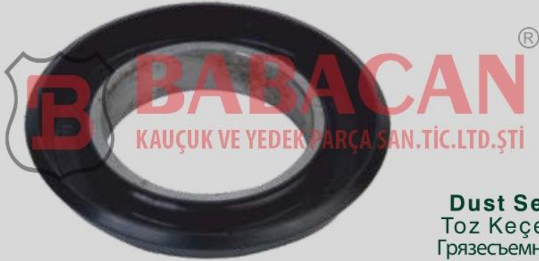
Dust Seal Toz Keçesi Грязесъемник