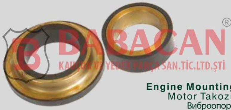
Engine Mounting Motor Takoza Виброопора