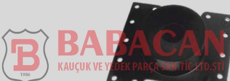
Upper Shock Absorber Üst Takoz Верхний эластомер