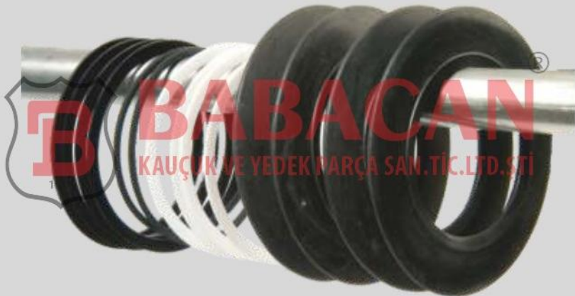
Rotary Seal Kit Fren Keçe Takımı Ремонтный комплект