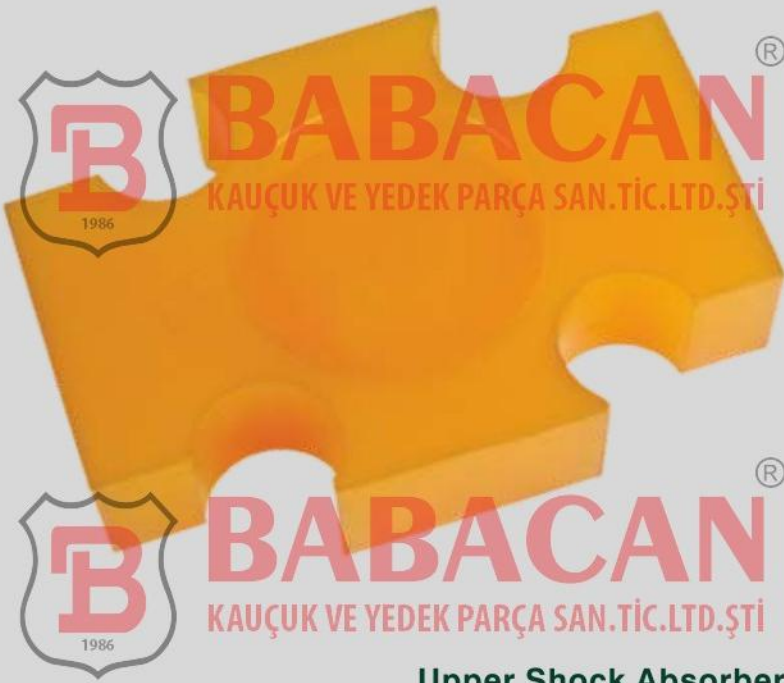
Upper Shock Absorber Üst Takoz Верхний эластомер