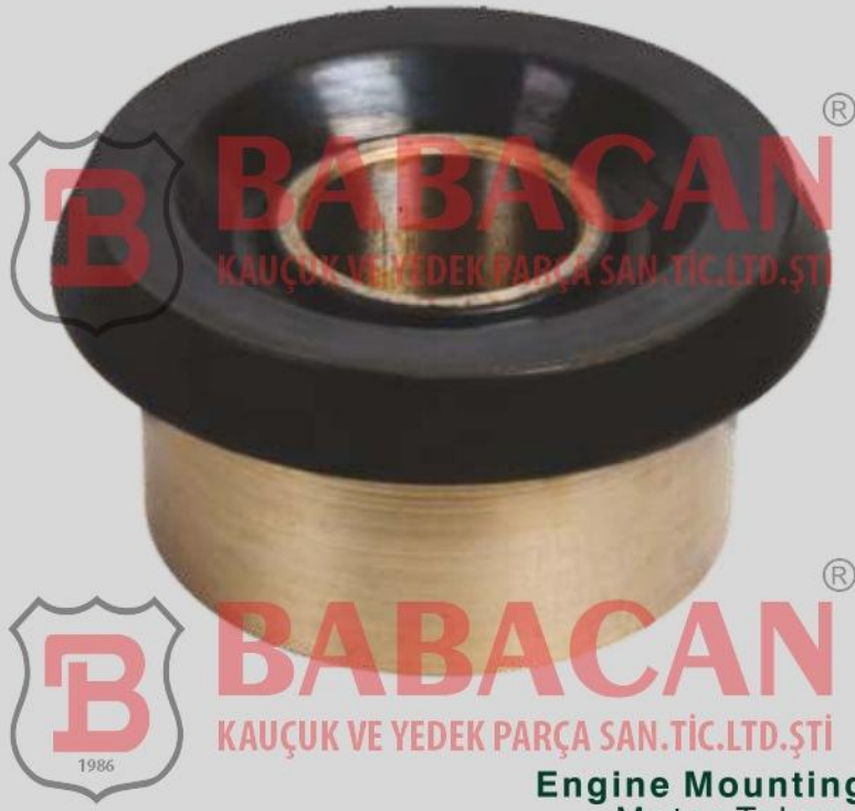
Engine Mounting Motor Takoza Виброопора