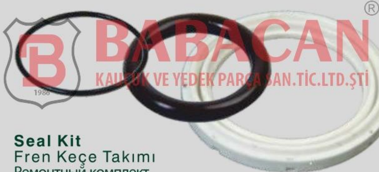
Seal Kit Fren Keçe Takımı Ремонтный комплект