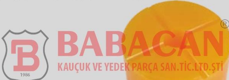
Upper Shock Absorber Üst Takoz Верхний эластомер