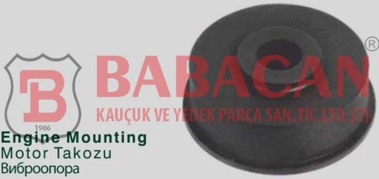
Engine Mounting Motor Takoza Виброопора