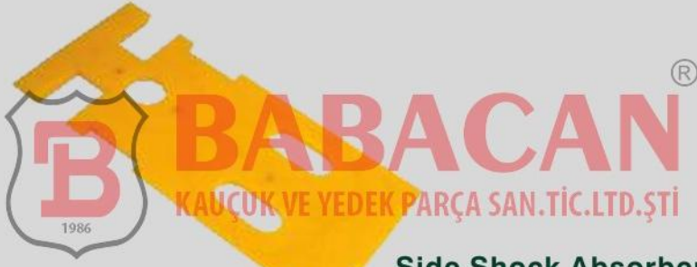
Side Shock Absorber Yan Pleyt Боковой эластомер