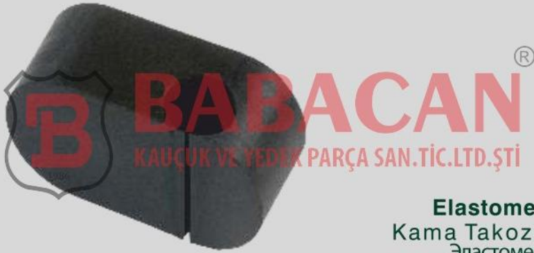
Elastomer Kama Takozu Эластомер