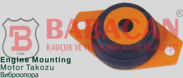
Engine Mounting Motor Takoza Виброопора