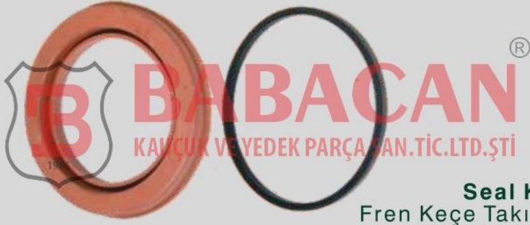
Seal Kit Fren Keçe Takımı Ремонтный комплект