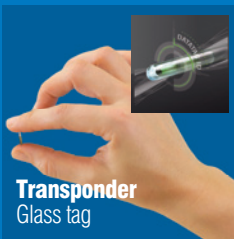
Transponder Glass tag