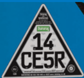
Unique Tamper-Evident Identification Label