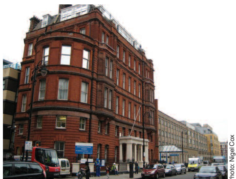
Great Ormond Street Hospital, 1 x J420 – 1.4MWe