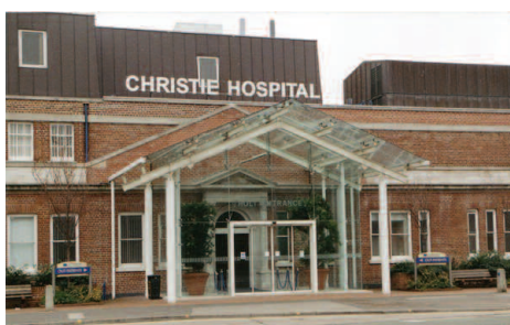
Christie Hospital, 1 x J420 – 1.4MWe