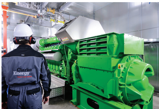
Preston Hospital, UK, 1 x JMS616

The GE Jenbacher gas engine is known for having the highest levels of electrical efficiency on the market. When coupled with a contractual maintenance agreement with Clarke Energy, it will give peace of mind to the customer that they will achieve the highest levels of availability and have constant returns on their investment.