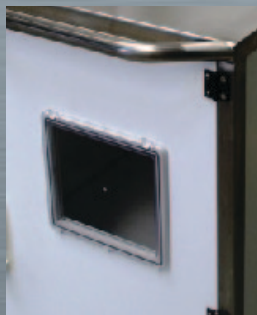
Slot model TAV L 24