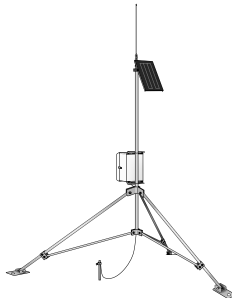
Repeater stations act as communication relays between stations that cannot communicate directly due to distance or obstacles. Repeater stations always use omnidirectional antennas.