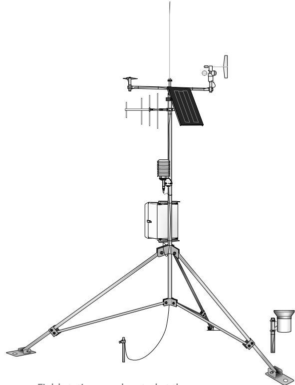
Field stations are located at the measurement site. This field station uses a Yagi antenna to transmit the data.