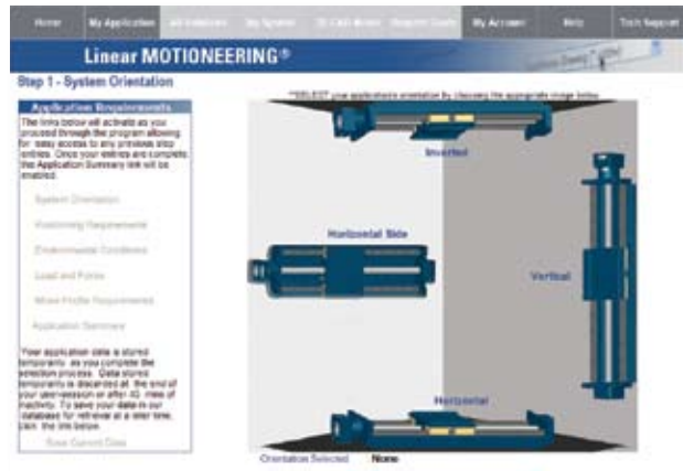
Your System Mounting Orientation is stored in the database to allow bearing and ball screw safety factor calculations.