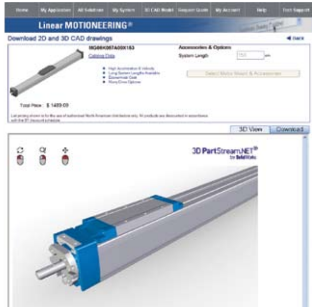
Linear Motioneering delivers interactive 3D models of your specific product selection.

The tool is easy to use, free and just a few clicks away at http://linearmotioneering.com/ . Never worry about selecting the right linear system again.